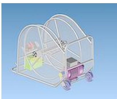
Version 2 (marketing planned for early 2014)