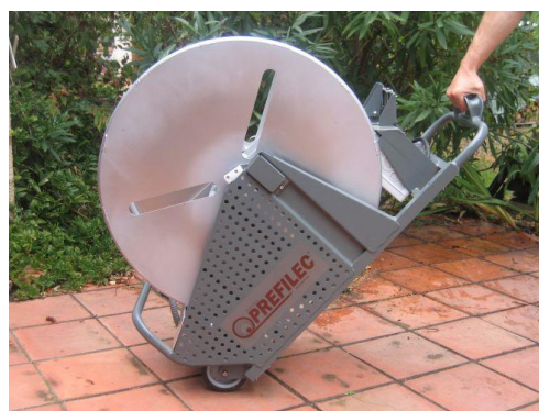
The document and photographs are not legally binding